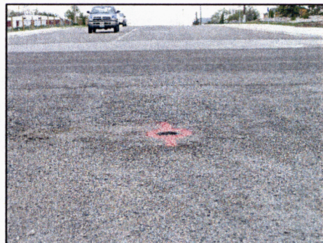
Looking West down Summit Dr.